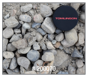
GRANULAR B TYPE 1

BEST USES: Base for construction. E.g., driveways, roads, etc.