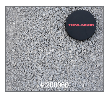
5mm REGULAR DUST 1/4"

Crushed stone dust. made up of crushed stone & fine aggregate.