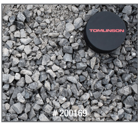
16mm GRAN M 5/8" LIMESTONE

BEST USES: Sewer pipe cover, driveways, pathways.