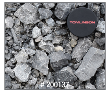
75mm GRAN B 3" LIMESTONE 100mm GRANULAR B 4"

BEST USES: Base for construction. E.g., driveways, roads, etc.