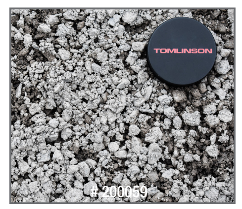
PIPE COVER (1/2" MINUS)