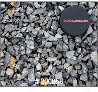
19mm GRANULAR A 3/4"

BEST USES: Leveling surfaces, interlock pathways.