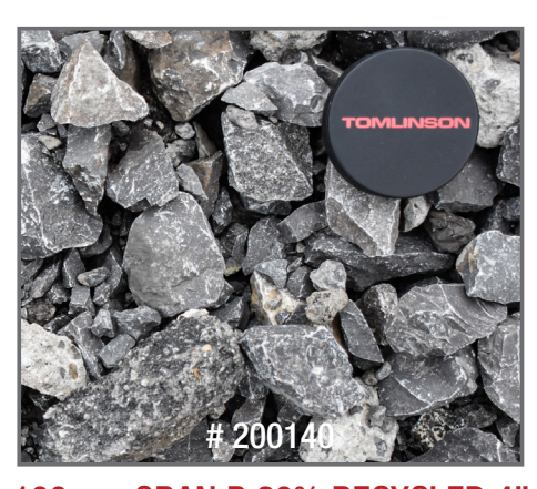
100mm GRAN B 20% RECYCLED 4"

BEST USES: Base for construction. E.g., driveways, roads.