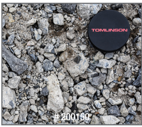
GRAN B TYPE 1 RECYCLED

150mm (6") minus crushed concrete with fines.