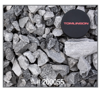
50mm GRANULAR B 2"

BEST USES: Sub-base, above granular B, load bearing material use in construction of roads, driveways, etc.