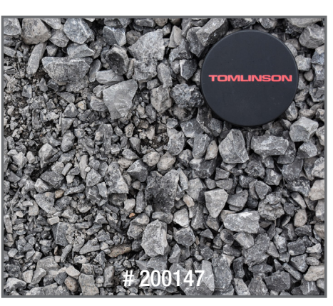
19mm GA RECYCLED 30% 3/4"

BEST USES: Base material for flagstone, retaining walls, walkways, patios or concrete.